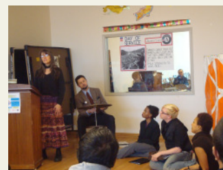
Still Point Theatre Collective