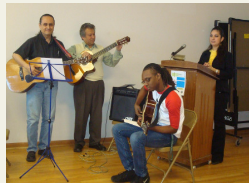
The AmeriCorps Members sang the songs We Shall Not Be Moved and Stand By Me.