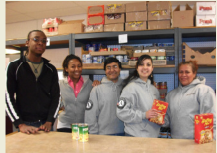
AmeriCorps members working together

We helped restocking food, repacking bulk foods, sorting clothing and unloading weekly deliveries from the Greater Chicago Food Depository.